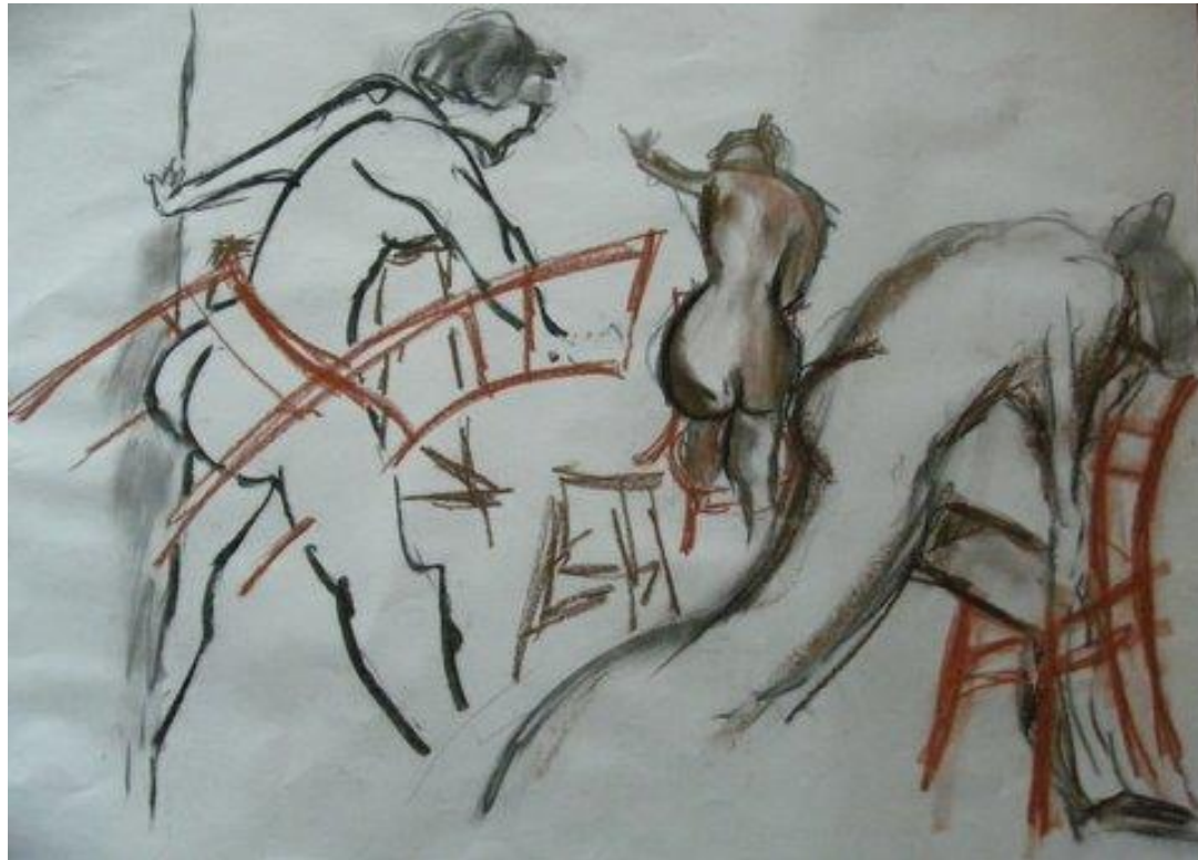
How can we know the dancer from the chair? Pastel and charcoal on paper, 2008